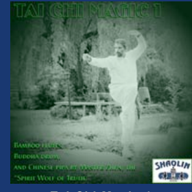
Tai Chi Magic 1 Buddha Zhen's Debut Album 2009