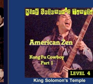
Part 1 of American Zen's LEVEL 4 = Kung Fu Cowboy 2010

With my family breaking up, all my financial stability was lost. With my kids leaving to follow their mom, I lost my investment in my family business and schools. Being smart doesn't mean you get what you want.