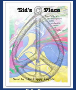
Sid's Place FRESH DRUGS! 2008